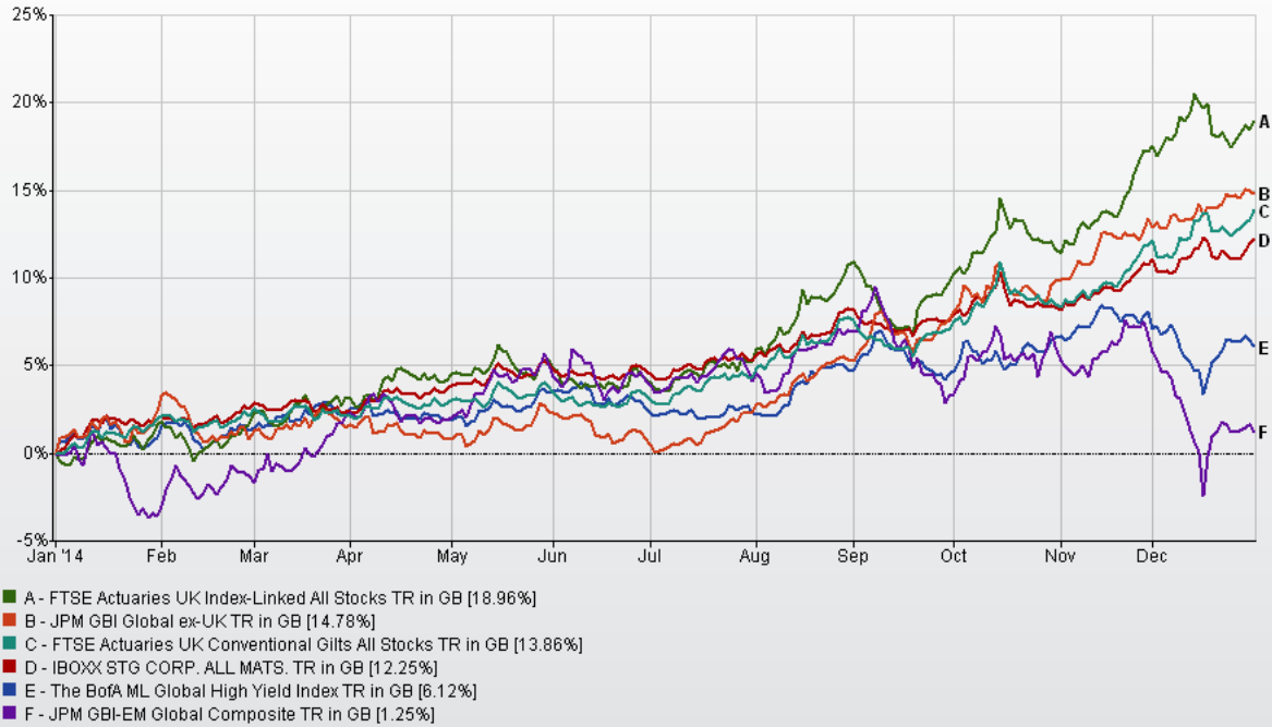
Chart showing 2014 returns for major fixed income indices:

01/01/2014 - 31/12/2014 Data from FE 2015