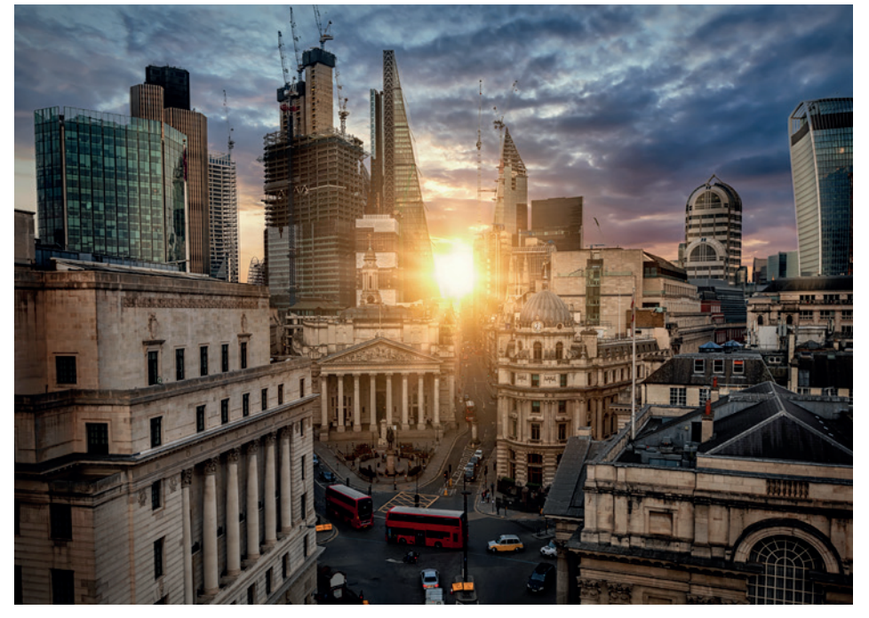
Written March 2020 and updated September 2021

Financial advice and regular reviews are essential to help position your portfolio in line with your objectives and attitude to risk, and to develop a well-defined investment plan, tailored to your objectives and risk profile.